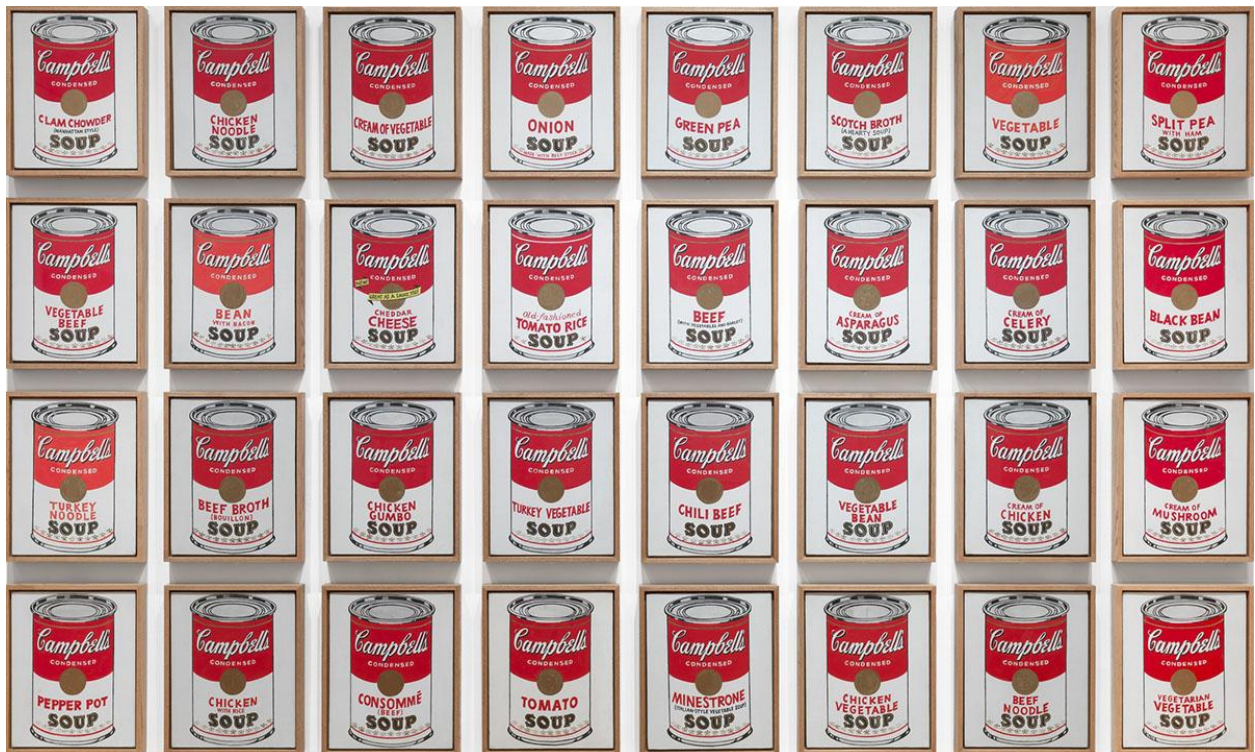
Warhol, Andy. Campbell's Soup Cans . 1962, The Museum of Modern Art, New York .

Why do I bring this up? Because there is no one-size-fits-all formula for becoming a successful NFT artist. Do not let anyone tell you that you must do it a certain way. All we have to do is look at history to see that this is not the case.